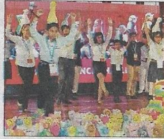
20 स्कूलों ने किया पार्टिसिपेट

■ एनबीटी न्यूज, गुड़गांव : सनसिटी वर्ल्ड स्कूल में अंतरराष्ट्रीय अकैडमिक प्रतियोगिता का आयोजन किया गया। इस दो दिवसीय कार्यक्रम में 20 स्कूलों के 500 से अधिक छात्रों ने हिस्सा लिया। वर्ल्ड स्कॉलर्स कप शीर्षक प्रतियोगिता में प्रमुख विषयों, जैसे विज्ञान, सामाजिक अध्ययन, कला और संगीत, साहित्य और इतिहास पर कॉम्पिटिशन हुआ।