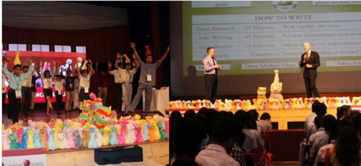
Suncity School hosts international academic tournament

Gurgaon-based Suncity School hosted a prestigious international academic tournament on May 1 and 2. The two-day event witnessed over 500 students' participation from across 20 schools such as Mayo College, Ajmer, G.D. Goenka Public School, Delhi, Delhi Public School, Gurgaon from Delhi-NCR and neighboring states. Titled 'World Scholar's Cup', the competition tested students' mastery over core subjects namely Science, Social Studies, Arts and Music, Literature, History and Special Area. The top finalists will get a chance to compete at the Yale University, one of the leading educational institutions of the world.