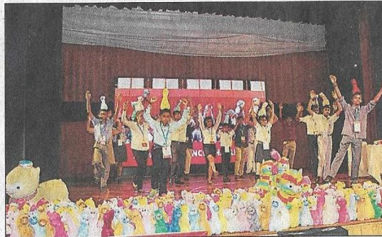
■ The World Scholars' Cup regional round is being held at a city school in Sector 54.

"The objective of organising the World Scholar's Cup is to help discover students' interests and aptitudes. The competition also hones their public speaking and logical thinking